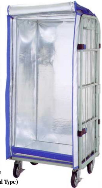
Cage Cart Type C-PACK V(Hard Type)