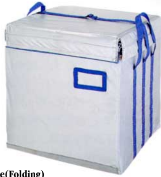
Box Type(Folding) C-PACK V(Hard Type)