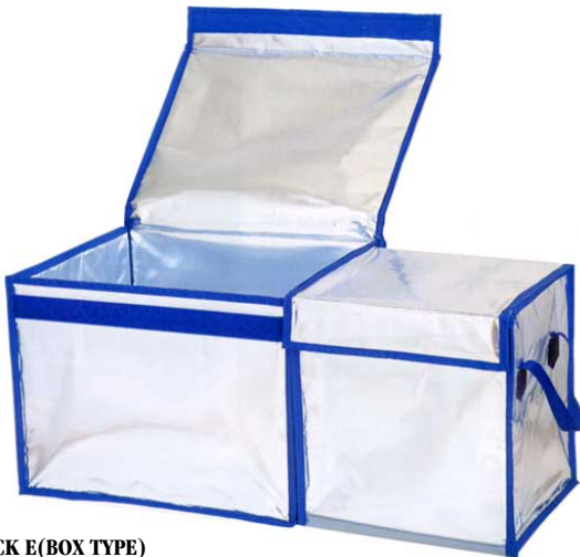
C-PACK E(BOX TYPE)