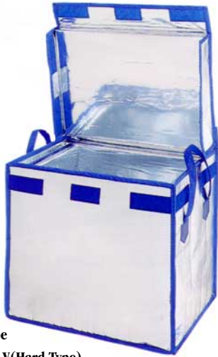
Box Type C-PACK V(Hard Type)