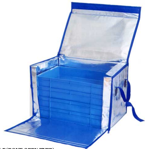
C-PACK E(FRONT OPEN TYPE)